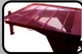
Deck Over Neck Mesh or Wood Floor