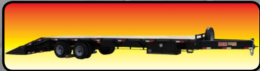
Shown with Pintle Hitch and 5' Dovetail with 3 Flipover Spring Assist Ramps and Side Mount Tool Box