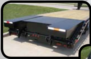
Shown with 5' Dovetail, 2 Spring Assist Ramps, and Popup Center