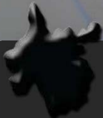
Jet Black (standard)