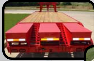
Shown with 5' Dovetail, and 3 Flipover Spring Assist Ramps