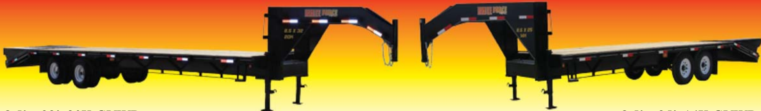
8.5' x 32' 20K GVWR