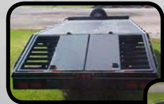
Shown with Dovetail Dual Popup w/ Self Store Ramps