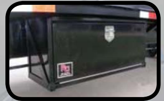
Side Mount Tool Box