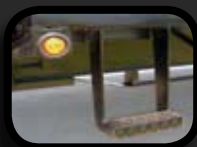
Step To Deck